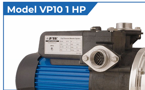
Model VP10 1 HP