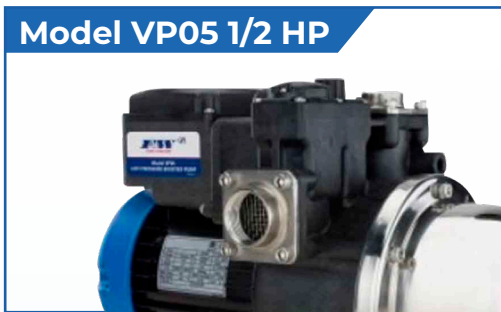
Model VP05 1/2 HP